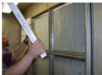
Specified Filters Prior to Test

The facility has standardized on 30/30® pre-filters and MERV 14 Durafil® final filters. The energy savings per filter is estimated to be $55.00. The facility, based upon the evaluation, has decided to eliminate one change per year of pre-filters and also decided that the final filters can serve the space for three years as opposed to the 18 months that the previous final filters were lasting — further saving the facility expense in product cost and labor.