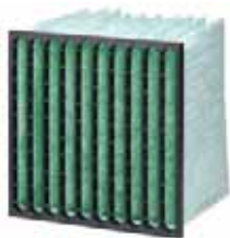
1. Hi-Flo XLT 7

These recommendations are based upon existing criterion as published by cognizant authorities, or best practice, based upon published data. For your specific application, contact Camfil for a detailed solution for your needs.