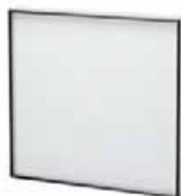
8. Megalam MD