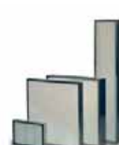
15. Ecopleat M6

As part of our program for continuous improvement, Camfil reserves the right to change specifications without notice.