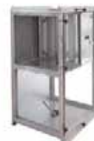
14. FCBL-A Classe C