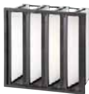
2. Opakfil ES