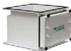
12. CamSafe 2