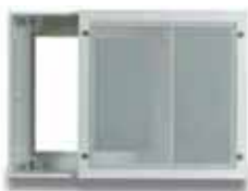
11. Sofdistri Reprise