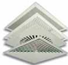
7. Softdistri Grille