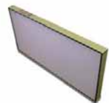
10. Megalam T Green