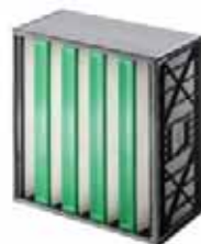
3. Absolute VG